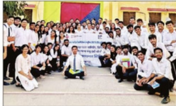
जिता कारागार लखनऊ के बाहर उरिखत शिक्षण छत्र।

अमृत विचार : प्रोजेक्टर आशा के तहत लखनऊ कारागार में एक शिक्षण का आयोजन हुआ। लोहिया राष्ट्रीय विधि विधि की विधिक सहायता समिति, विधिक सेवा केंद्र और प्रो वॉनो क्लब ने मिलकर कारागार में निरुद्ध बंदियों को नियम-कानून की जानकारी दी। पात्र कैदियों को अधिवक्ता उपलब्ध कराकर उनकी जमानत की कार्यवाई में तेजी लाने का प्रयास भी संयुक्त टीम की ओर से किया गया।