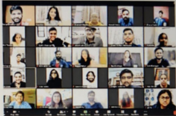
जुल मीटिंग में मदद पर चर्चा करते डा. राम मनोहर लोहिया राष्ट्रीय विधि विश्वविद्यालय के छात्र-छात्राएं

ज्या, लखनऊ : कोरोना काल में आकस्मिक, अस्पताल और अन्य संस्थाओं के लिए भटक रहे लोगों की मदद के लिए डा. राम मनोहर लोहिया राष्ट्रीय विधि विश्वविद्यालय की विधिक सहायता कमेटी ने मुहिम छेड़ी है। टोल फ्री मिस्ट्र कॉल नंबर के जरिए वह जनसमूहों की मदद करते हैं। वे टीम राजना लुन मीटिंग में मंजूर करती है कि कैसे ज्यादा से ज्यादा लोगों तक पहुंच बना सके। पिछले साल भी विश्वविद्यालय ने प्रयासों में मदद को कदम उठाए थे, जिसमें सफलता मिली थी। उसी तरह इस साल कोविड रिलीफ मुहिम के जरिए मदद की जा रही है। विधिक सहायता क्लिनिक, विश्वविद्यालय के पूर्व और मौजूदा छात्र कोरोना महामारी से लड़ने